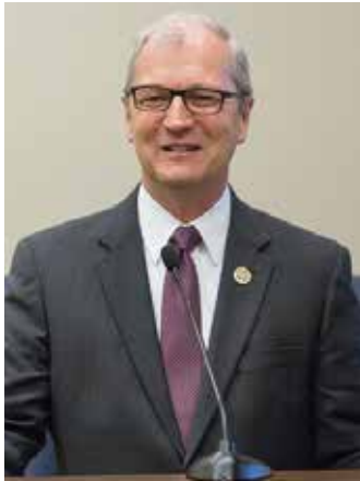
Congressman Kevin Cramer urges legislative support for H.R. 3742.

On Thursday, November 19, 2015, Patient Services Incorporated (PSI), along with its advocacy partner, the American Kidney Fund (AKF), hosted a Congressional briefing entitled – Strengthening the Safety Net through Health Insurance Premium Assistance . This briefing brought together patient advocates and Congressional staff to draw attention to an issue affecting patient