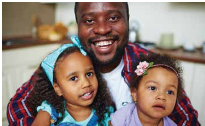
Nearly 10 million people will be unable to pay for rent, food and heat because of their medical bills.