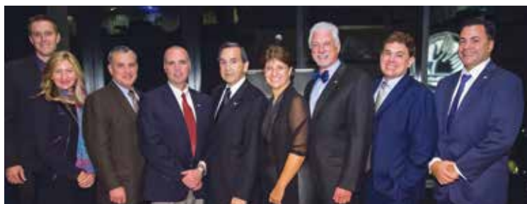
PSI's Board of Directors gather together at the Hope & Health Gala.