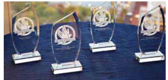
The Hope & Health Gala celebrated PSI's patient assistance model of helping those in need.